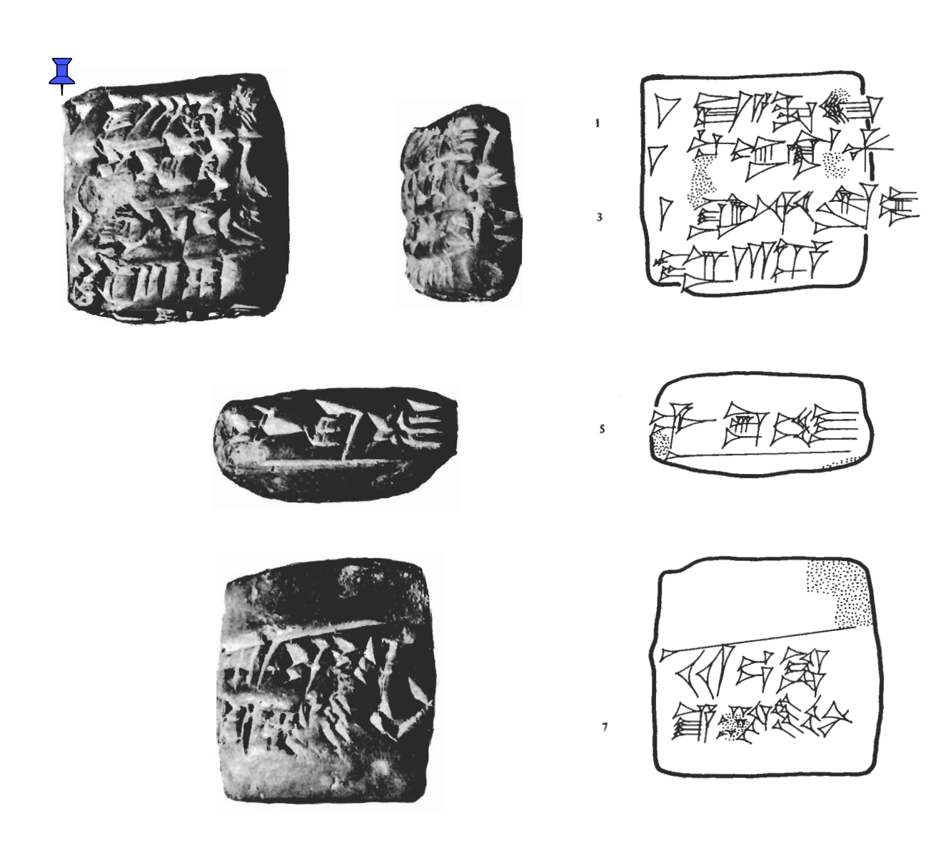
Figure 1. TPR 2 1: Photograph and Autograph Copy (1:1)